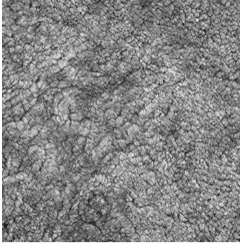
22 Scandinavian Grey